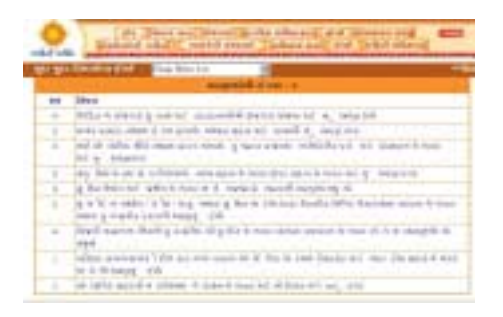
Forms of different offices