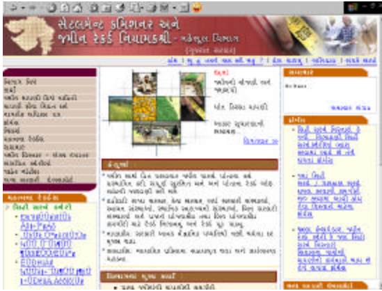
Front Page of the Land Records website

The Ahmedabad Collectorate website can be viewed at www.Ahmedabad@gujarat.gov.in/