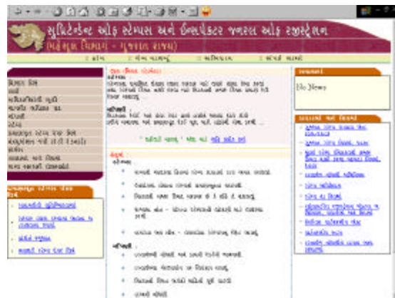
Front Page of the Stamp Generation website

The Stamp Registration website can be viewed at www.stampsregistration@gujarat.gov.in/