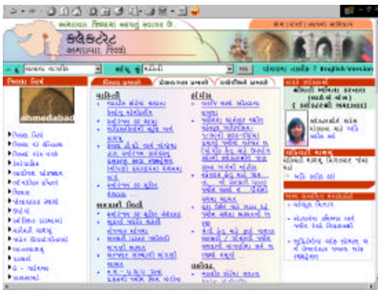
Front Page of the Ahmedabad Collectorate website

The Ahmedabad Collectorate website can be viewed at www.Ahmedabad@gujarat.gov.in/