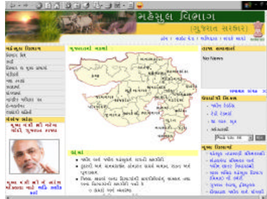
Front Page of the RD website

The RD website can be viewed at www.revenuedepartment@gujarat.gov.in/